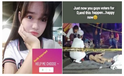
Picture 1: Victim's Instagram poll and her cousin's post about her death

According to MCMC, those who incited the 16-year-old girl in Sarawak to commit suicide based on the poll on her Instagram, may be liable under Section 305 of the Penal Code, which states that it is wrong to incite individuals aged below 18 to commit suicide.